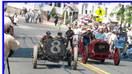
The Alco-6 Racer during the recent Centennial Celebration of the Port Jefferson Hill Climb