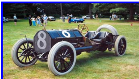
The BLACK BEAST Today